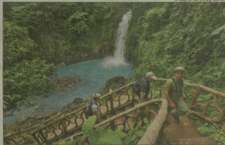
GREEN PARADISE: The Rio Celeste Falls in Costa Rica

While Costa Rica is a small country, with a population of about 4.8 million people, it has