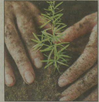
The Fieldbrook Redwood Stump was felled in 1890 to satisfy a drunken bet. The tree is about to be reborn as a clone planted on the coast of Cornwall

The Fieldbrook stump is a Californian coast redwood which was felled under the orders of William Waldorf Astor, a wealthy American living in Britain, who became embroiled in a bar-room bet about making a table seating 40 from a single cross-section of a tree.