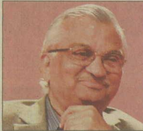
■ Anil Kakodkar

Sources said Kakodkar had decided to stay on until the end of his tenure in May, but the disagreement between the IITs and HRD ministry is unlikely to be resolved soon as five of the nine members of the selection panel have informed the ministry they will not be available for the next meeting on March 22.