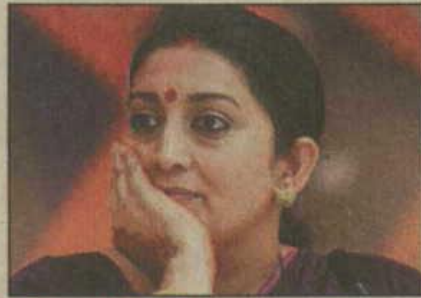
ON COLLISION COURSE: Irani

IIT counsel told the court that though the software for common counselling is expected to be ready by March-end by National Informatics Centre, it may not be thoroughly tested to be put in use by June/July for admissions in the academic year 2015. Instead, IITs have suggested "synchronized admission counselling" for IITs and NITs, which will be done separately