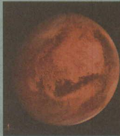
■ Image of a dust storm on Mars sent by Mangalyaan

On September 24, 2014, India created history by becoming the first country to succeed on its first Mars