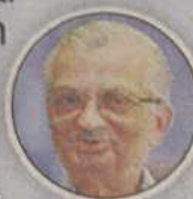
— Anil Kakodkar CHAIRMAN OF IIT-BOMBAY'S BOARD OF GOVERNORS

Looking at all 36 candidates in one day is not right. There is a fundamental difficulty with the process. How do you ensure that you make the correct selection?"