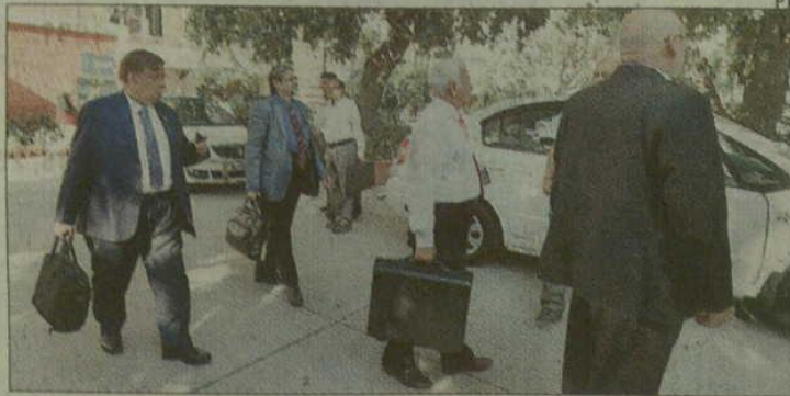
IIT selection panel members leave after a meeting with HRD Minister Smriti Irani in New Delhi on Sunday

Kakodkar, a member of the selection committee and